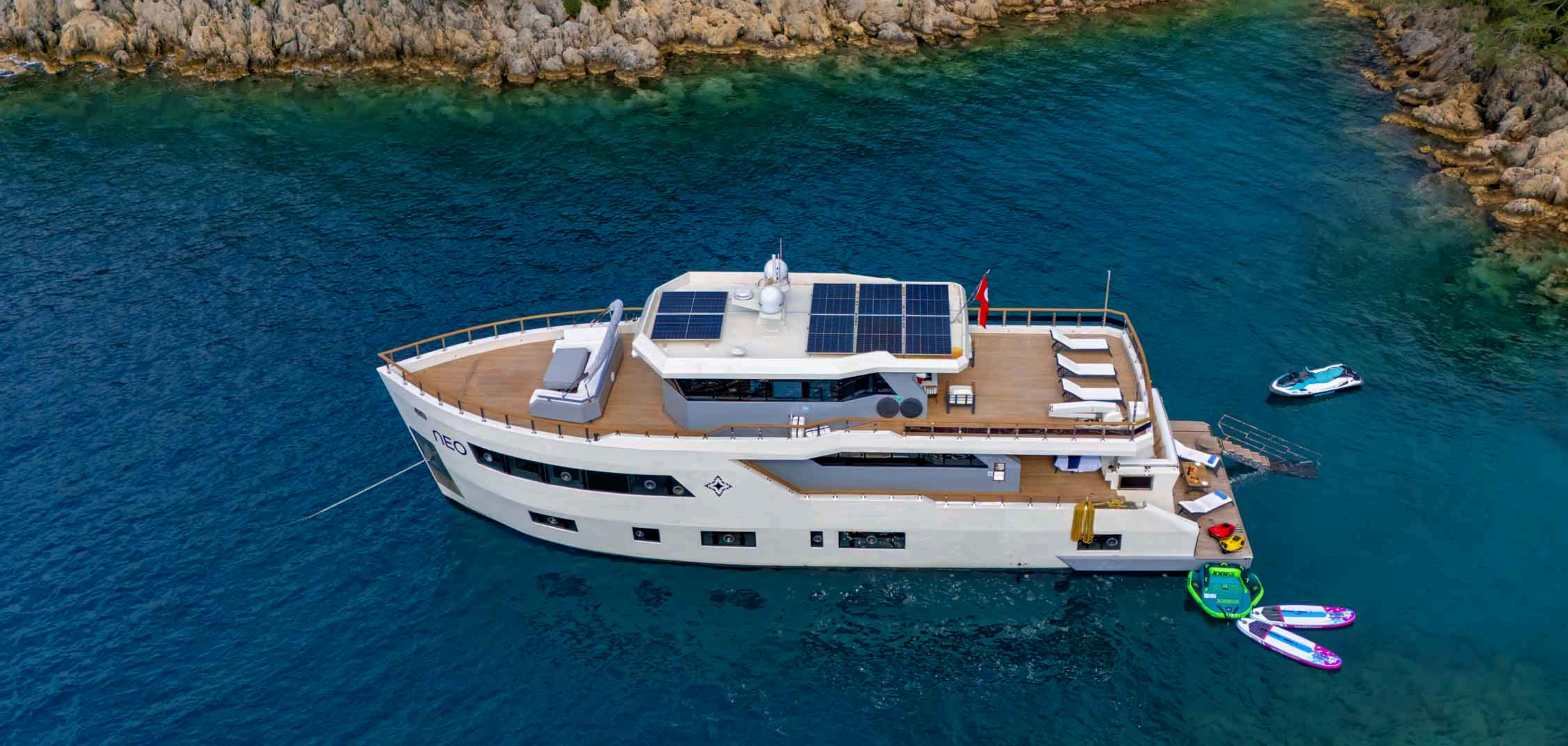
NEO 30 mt / 5 cabins / 11 guests